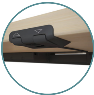
CURRENT Intuitive Lift Interface

Active Touch reminds users to change posture with Active Motion: subtle desk movements that encourage users to move throughout the day. Users can create a profile with preset desk heights and preferred intervals of sitting and standing.