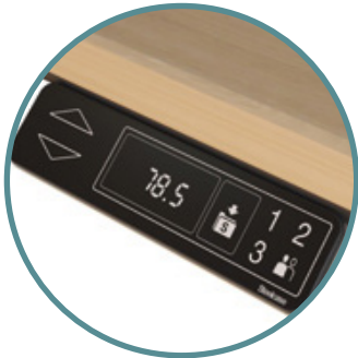
CURRENT Programmable Lift Interface

Please note that new orders of Ology will come with new user interface as indicated below